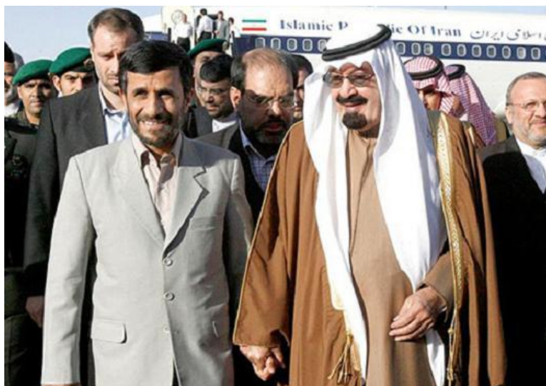
Friends or Foes?

Pakistan holds a unique strategic, military, political and ideological place among Muslim world and is the only nuclear power in the entire Muslim world having cordial relations with every Muslim country, irrespective of ethnic and sectarian demography, giving it a distinctive political stature. History of Pakistani armed forces fighting in Arab-Israel wars in 1967 and 1973 is yet another unique honor for Pakistan among the Muslim states. On sectarian level, Pakistan is not a monolithic state like Iran or Saudi Arabia rather its sectarian demography contains a sizeable Shia population among the majority Sunni. This Shia populace is well integrated with Pakistani society and is playing a vital role in progress and development.