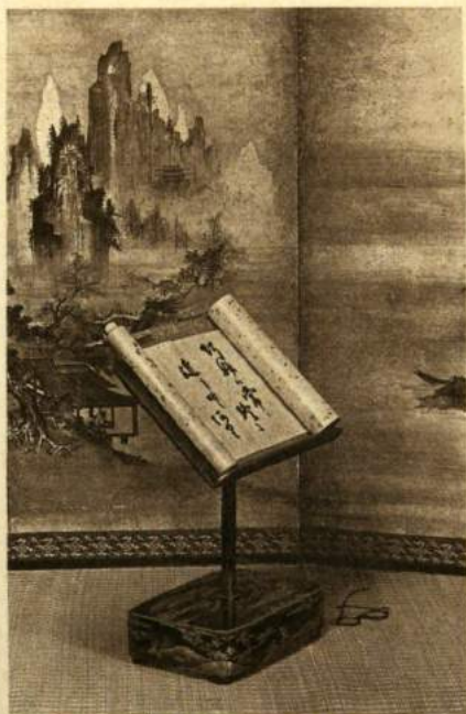
EX LIBRIS RUSSELL GRAY